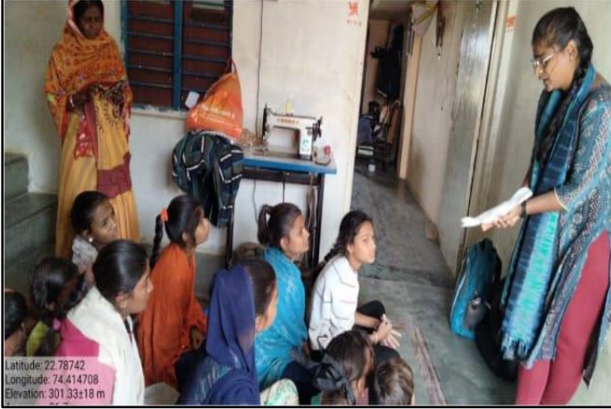
Latitude: 22.78742 Longitude: 74.414708 Elevation: 301.33218 m