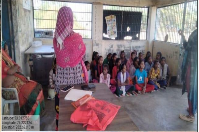
Latitude: 23.012755 Longitude: 74.222124 Elevation: 282.6210 m