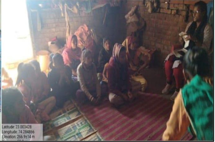
Latitude: 23.003428 Longitude: 74.284866 Elevation: 266.9214 m