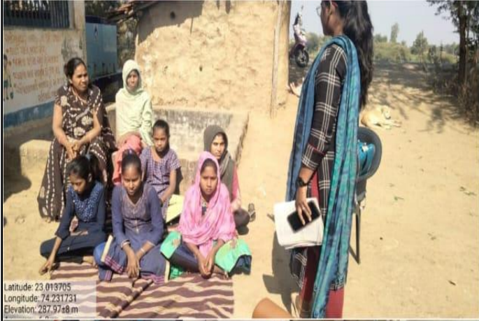
Latitude: 23.013705 Longitude: 74.231731 Elevation: 287.9748 m